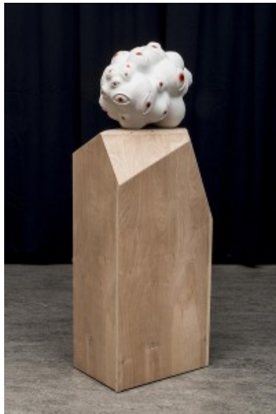
Tanya Batura, Untitled, 2014

Imagine meeting someone, and knowing that you will one day fall madly in love with that person, and you have mastered the Japanese concept of Koi No Yokan. Love is not immediately