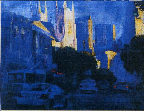
COLUMBUS STREET BY LANA RAK