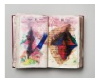
Works on Paper Group Exhibition