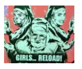
Femme Fierce: Reloaded 2015